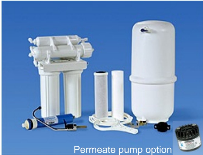
Permeate pump option

Four stage reverse osmosis system produces up to 50 gallons a day of pure fresh water from water that is currently unsuitable to drink. Membrane will remove 98% of contaminants and salts and leaves crystal clear, pure fresh drinking water. Requires feed water pressure of 45 psi or greater. If water pressure is low, see unit below or add non-electric permeate pump option.